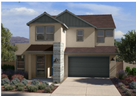
2D - MODERN FARMHOUSE