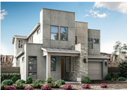
2B - DESERT CONTEMPORARY