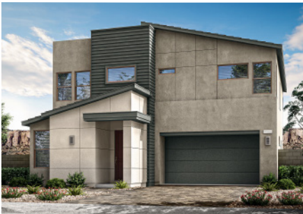
3C - NEVADA LIVING