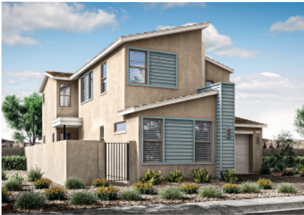
3C - NEVADA LIVING