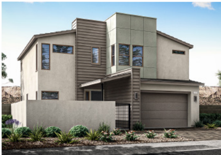
1C - NEVADA LIVING