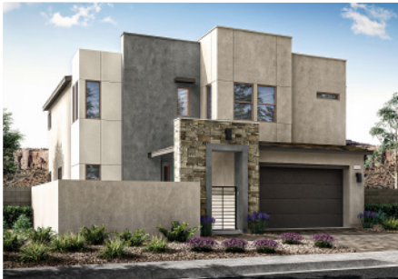
1B - DESERT CONTEMPORARY