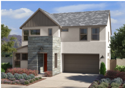
3D - MODERN FARMHOUSE