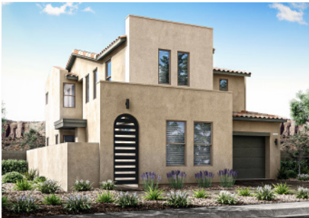
3A - MODERN SPANISH

2,430 sq ft | 2 - 4 Bedrooms | 2.5 - 3 Baths | 2 Bay Garage