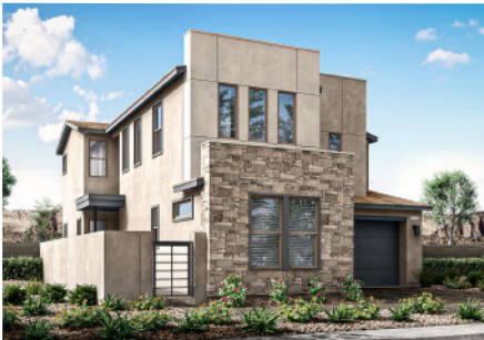
3B - DESERT CONTEMPORARY