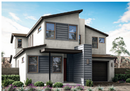
2C - NEVADA LIVING