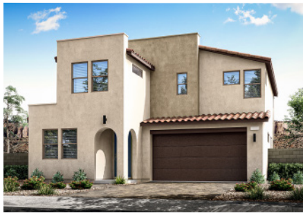
2A - MODERN SPANISH