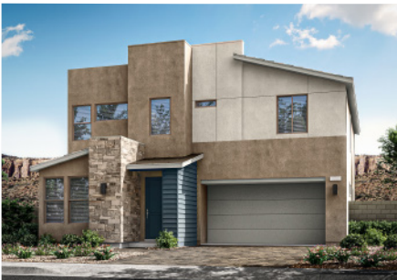
3B - DESERT CONTEMPORARY