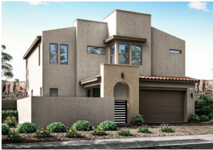
1A - MODERN SPANISH

2,014 sq ft | 2 - 3 Bedrooms | 2.5 Baths | 2 Bay Garage