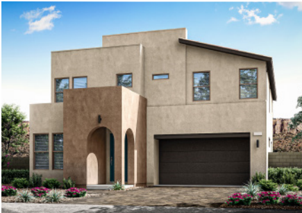
3A - MODERN SPANISH